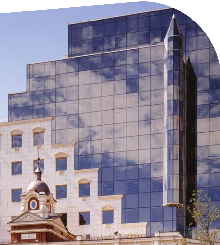
Aysberg Business Centre, Kiev, Ukraine – Pilkington Eclipse Advantage™ Bronze

Pilkington Optifloat™ Tint can be handled, processed and assembled into Insulating Glass Units as normal float glass. For solar control and thermal performance, Pilkington Optifloat™ Tint can be combined with Pilkington low-emissivity glass in an Insulating Glass Unit.