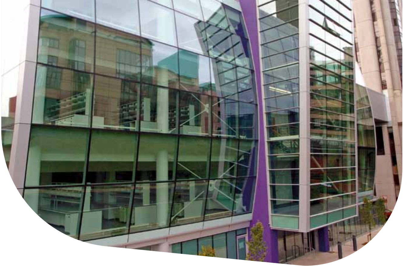
The Light Building, Leeds – Pilkington Suncool ™ 66/33