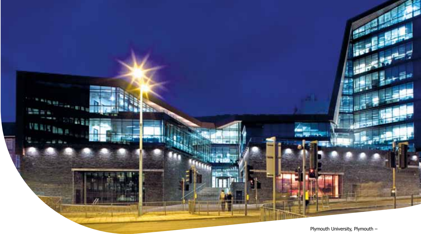
Plymouth University, Plymouth – Pilkington Suncool ™ 50/25