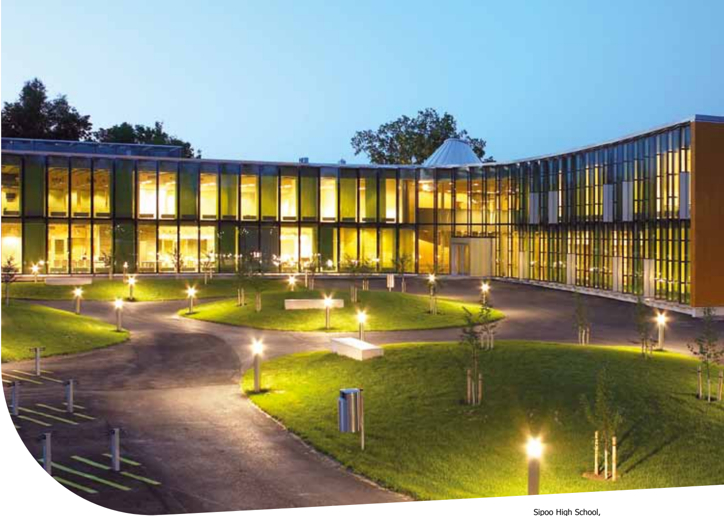
Sipoo High School, Sipoo Nikkilä, Finland – Pilkington Suncool ™ 66/33