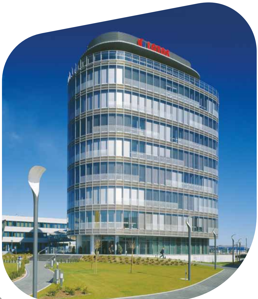
Lotos SA office building, Gdańsk, Poland – Pilkington Suncool™ 70/40

Pilkington Activ™ Solar Control range – blue and neutral options with both solar control and self-cleaning properties