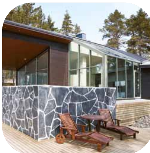
Airiston Lumous Villa, Airisto, Parainen, Finland – Pilkington Activ Suncool ™ 70/40

The Pilkington Activ ™ Solar Control range comprises Pilkington Activ ™ Blue, Pilkington Activ ™ Neutral and Pilkington Activ Suncool ™ and combines the benefits of self-cleaning with varying degrees of solar control performance, offering the ultimate range of solar control solutions for hard-to-reach places that are difficult to clean. Often overhead glazing is subject to high levels of solar gain and is difficult to access for cleaning. Pilkington Activ ™ with solar control provides the ideal combination for dealing with these areas.