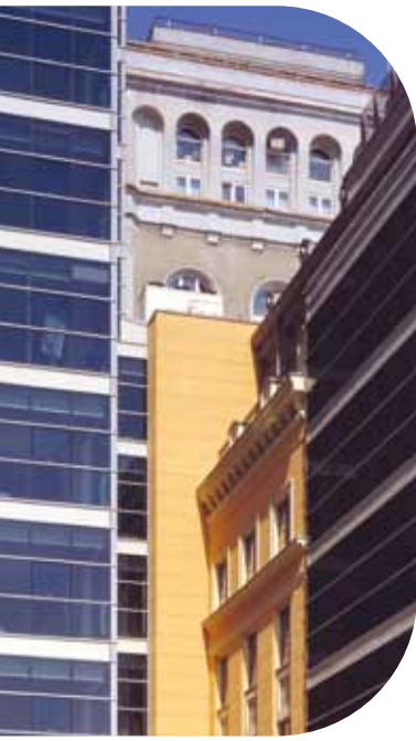
Polish-German Foundation, Warsaw, Poland – Pilkington Optifloat™ Grey